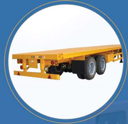
FLAT BED TRAILER