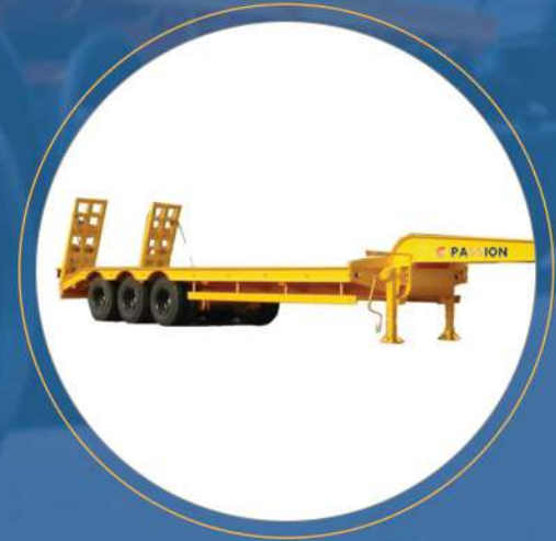
LOW BED TRAILER