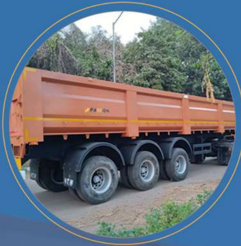
SIDE WALL TRAILER