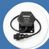
AXLE WEIGHT LOAD SENSOR