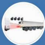
360 PARKING SENSOR