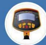
ON BOARD WEIGHING