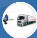
TPMS (Tyre Pressure Monitoring)