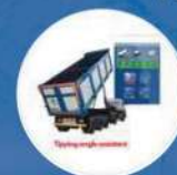
TRUCK TILT ASSISTANCE