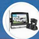
REAR PARKING CAMERA